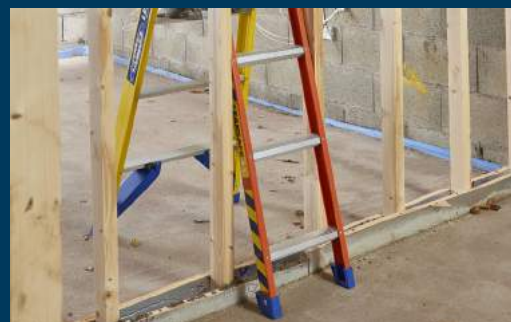
Compact rear section fits between framing studs