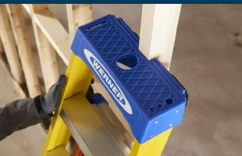
Unique top for corner, stud or pole leaning