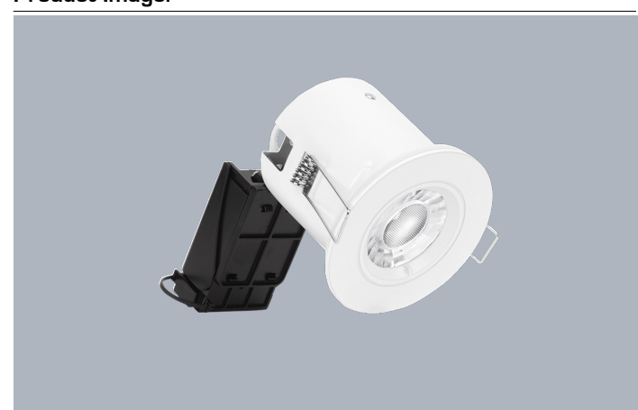
EFD™ PRO Fixed / IP Rated Professional Fire Rated Downlight